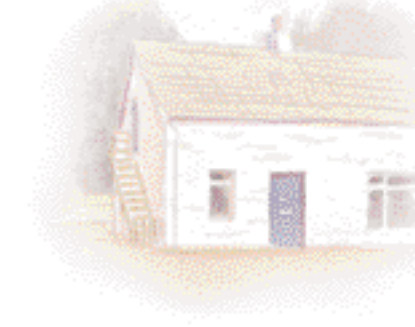
Bell Cottage Sleeps 6-7

All on ground floor: large sitting room. Large kitchen with dining area. Bathroom. 3 bedrooms (1 double, 2 twin). Extra lavatory. Lobby/laundry area.