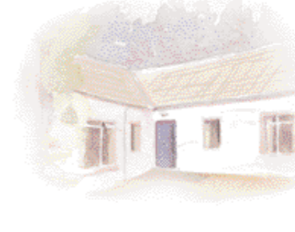
Dairy Cottage Sleeps 6

All on ground floor: sitting/dining room with hatch through to kitchen. 3 bedrooms (1 double, 1 twin, 1 bunk). Bathroom.