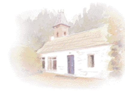
Tower Cottage Sleeps 6

Down stairs: sitting room, kitchen with dining area. 1 single bedroom. Upstairs: 2 bedrooms (1 double, 1 twin). Bathroom.