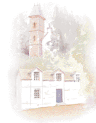
Millhouse Sleeps 5

Down stairs: sitting/dining room with hatch through to kitchen. Bathroom. Upstairs: 2 bedrooms (1 double, 1 twin).