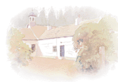
Chestnut Cottage Sleeps 4

THESE SPECIALLY CONVERTED traditional cottages were formerly part of the old Home Farm. They adjoin each other around a charming courtyard set in quiet secluded woods, well away from the road. Barn owls live here and can frequently be glimpsed on summer evenings. There is a special woodland walk - The Glen - from the cottages through woodland and past two spectacular waterfalls.